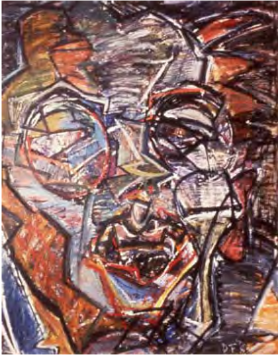
September self portrait 1983