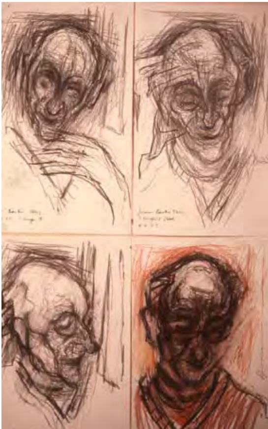
Four studies of James Barker 1987