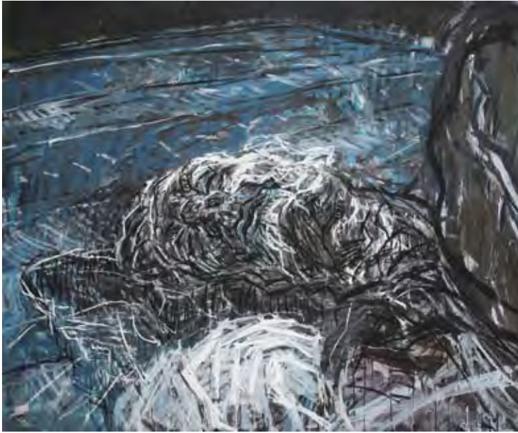
Large head C.S. No.2 2006 acrylic, gouache, pastel and charcoal on paper 166.5 x 198.5cm Collection of the artist