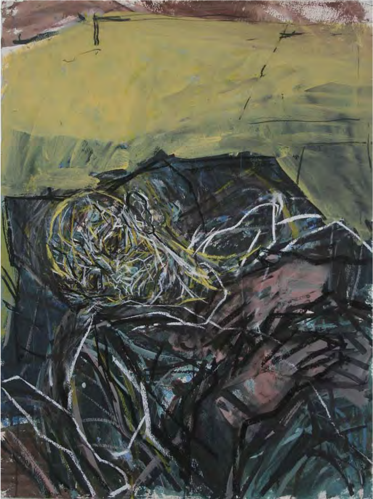
D.G. No.12 2008-2009 acrylic, gouache, ink, charcoal, chinagraph and pastel on paper 76 x 57cm Kedumba Collection of Contemporary Australian Drawings