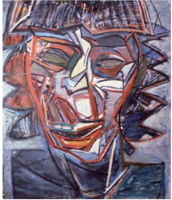
Head of SA with red outline 1984