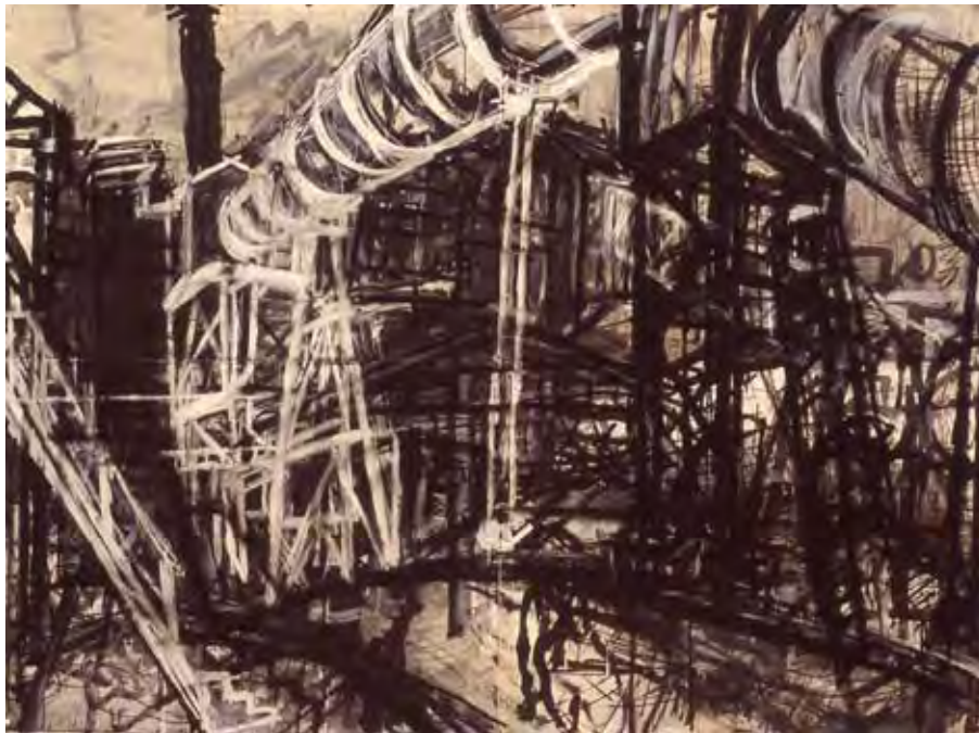
Transfer tower 1996