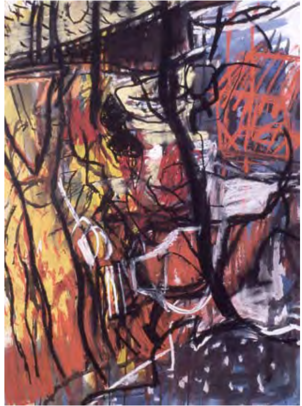
Black tree 1993