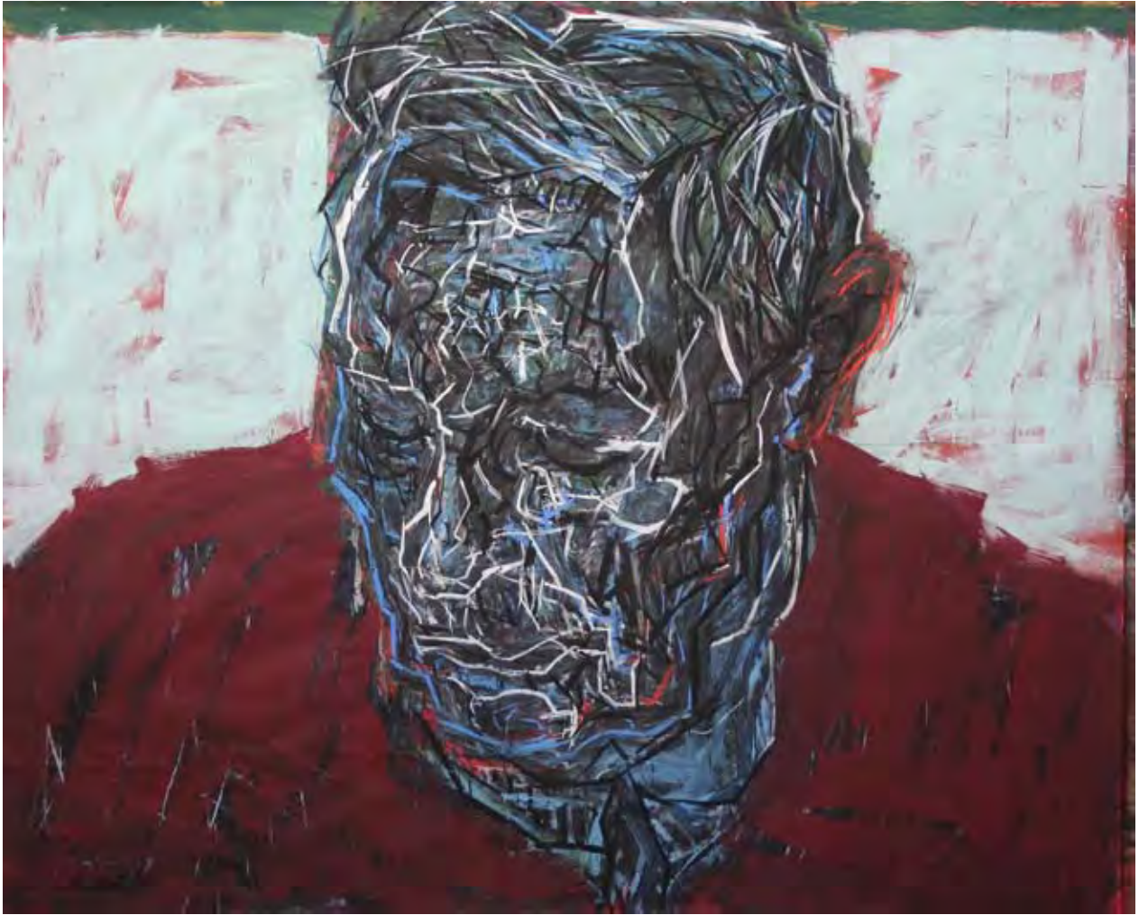
Large head W.C.F. No. 1 2007 Acrylic, gouache, pastel and charcoal on paper 183 x 210cm Clayton Utz collection