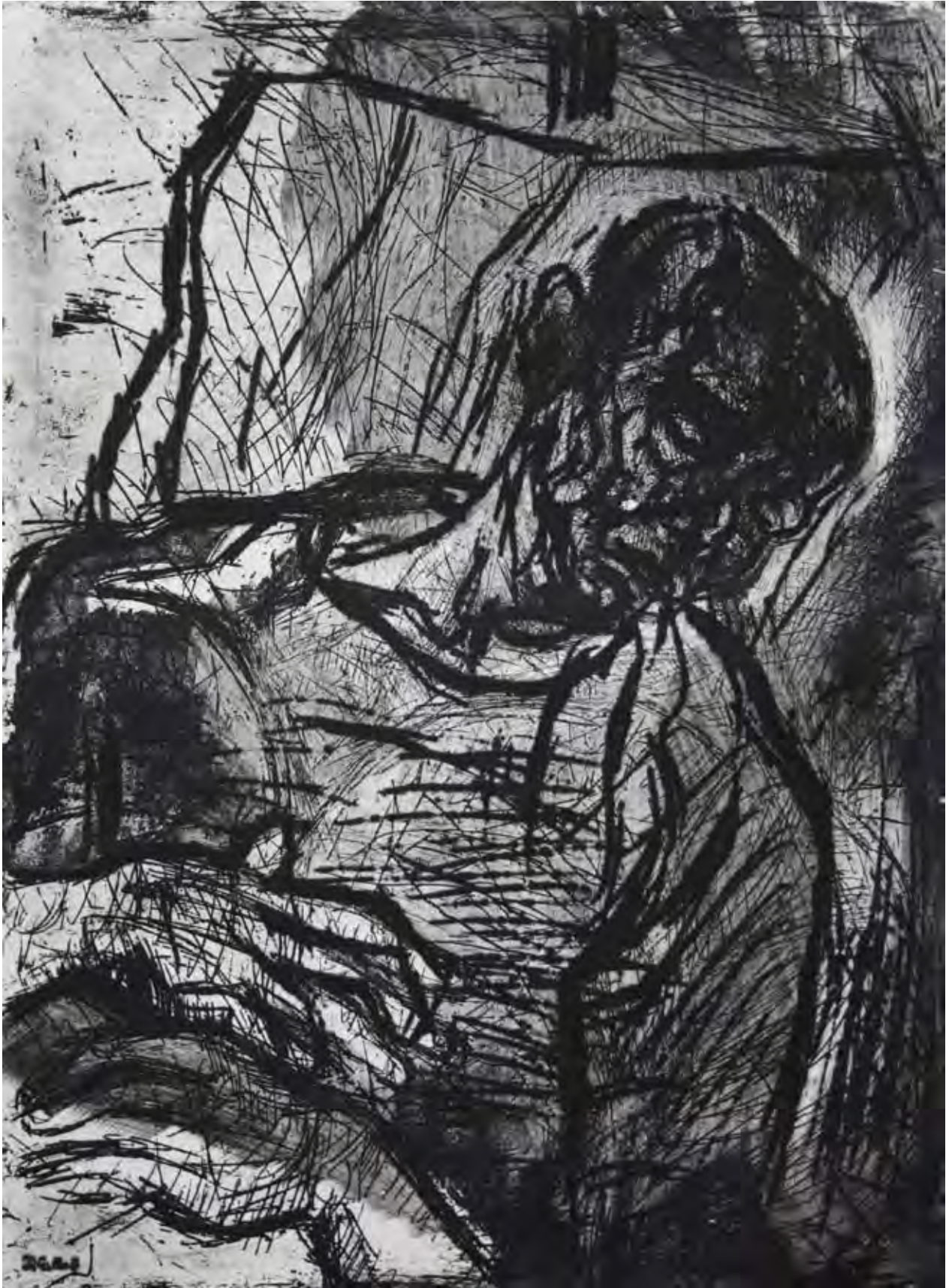
D.G. No.5 2010 copper etching 54 x 74cm Collection of the artist