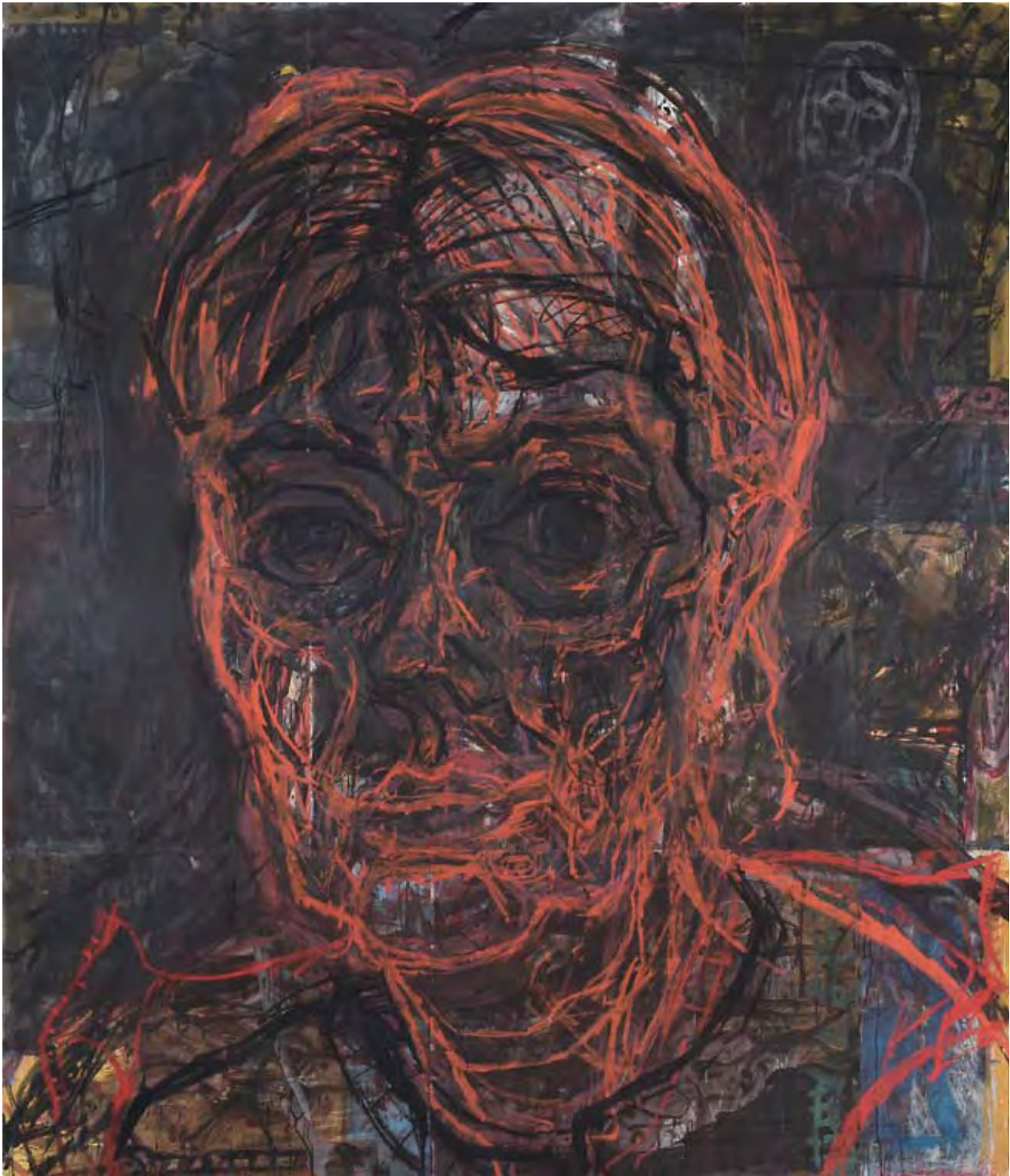
Red portrait Suzanne 2000 acrylic, gouache, monotype and pastel on paper 172.3 x 199.2cm Moran Prizes collection