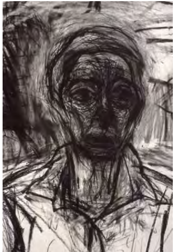
Head of KR 1995