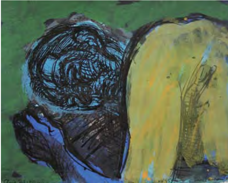
C.S. study No.45 2007

acrylic, gouache, etching, pen and ink on paper 28 x 36.5cm