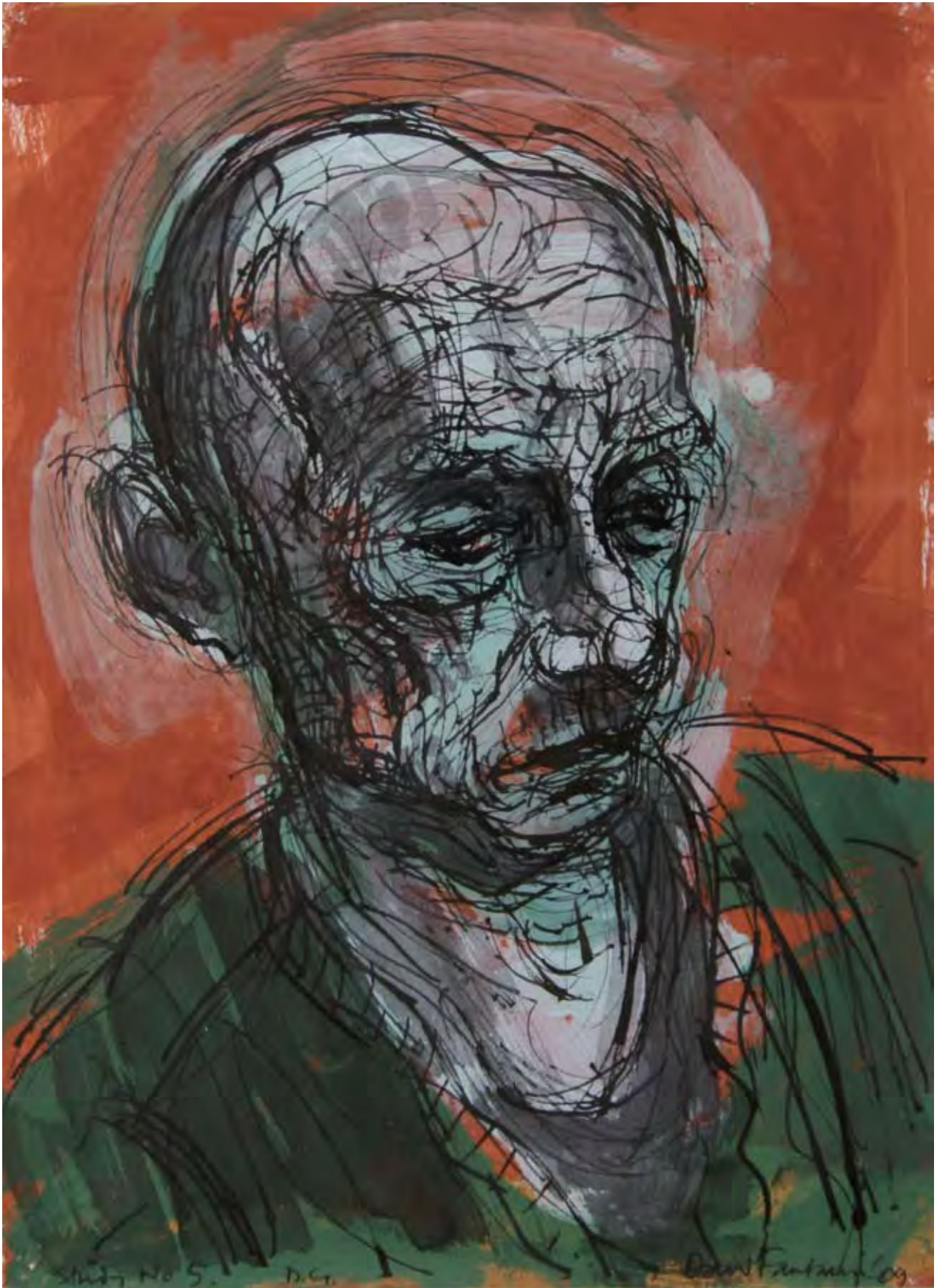
D.G. Study No.5 2009 acrylic, gouache, etching, pen and ink on paper 38.0 x 28.0cm Collection of Virginia Lloyd-Tait