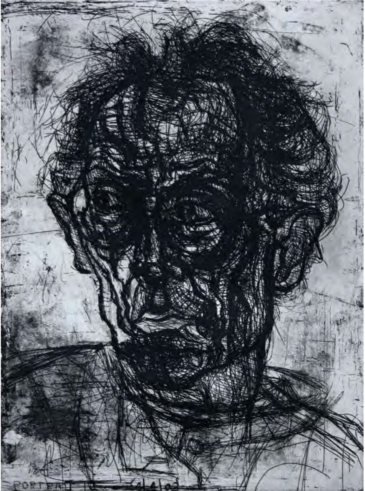
Auto portrait No.12 2003 copper etching 3/20 33.5 x 24.8cm image Collection of the artist