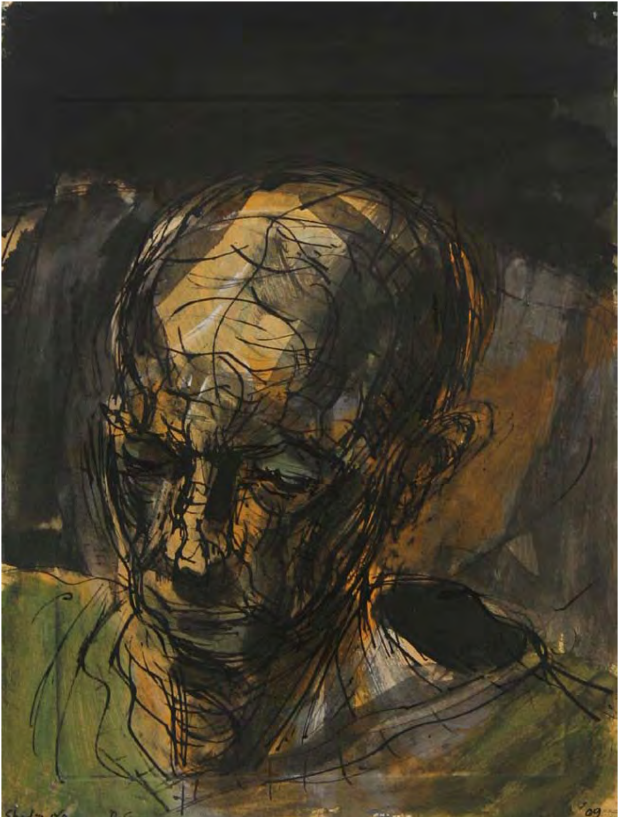
D.G. study No.1 2009 acrylic, gouache, etching, pen and ink on paper 29 x 30cm Private collection