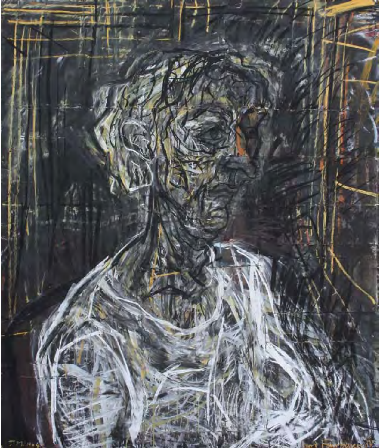
Jeanette No.4 2005 acrylic, gouache, drypoint, charcoal, pastel and ink on paper 210 x 183cm Collection of the artist